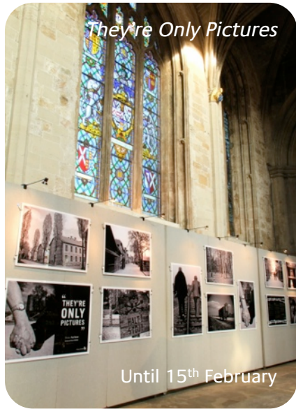
They're Only Pictures